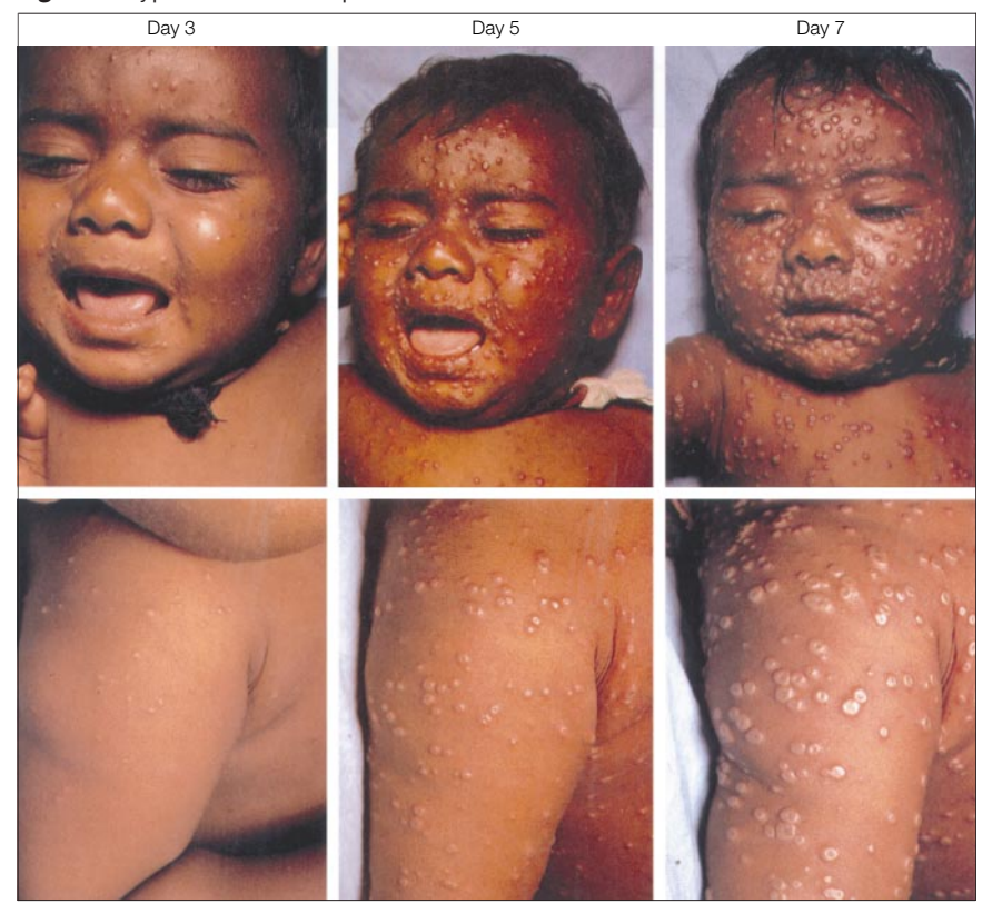
Figure shows the appearance of the rash at days 3, 5, and 7 of evolution. Note that lesions are more dense on the face and extremities than on the trunk; that they appear on the palms of the hand; and that they are similar in appearance to each other. If this were a case of chickenpox, one would expect to see, in any area, macules, papules, pustules, and lesions with scabs. Reproduced with permission from the World Health Organization.<sup>2</sup>